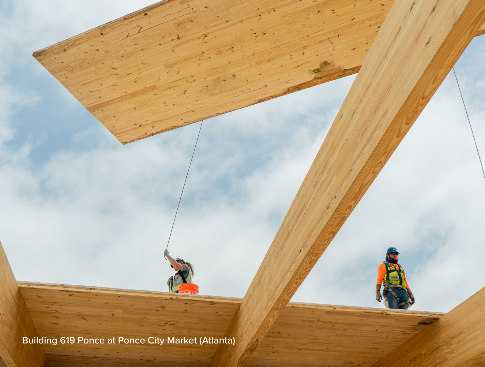
Building 619 Ponce at Ponce City Market (Atlanta)